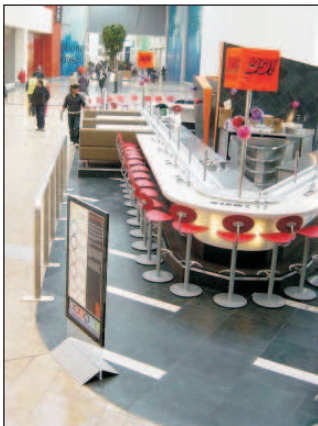
MySushi in Milan centre