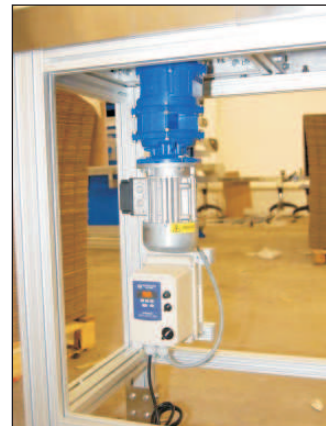
Variable speed drive